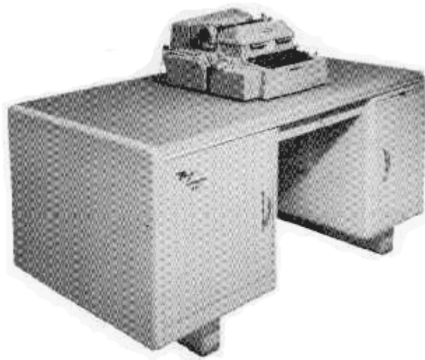
AN-1 UNIVERSAL CODE ACCESSORY WITH 35-4 FLEXOWRITER

The Model AN-1 Universal Code Accessory provides compatibility between the computer and external, data-processing equipment and also prepares tape for machine tool control.